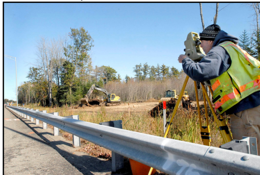
Monday 19 October 2009. Start of Turnpike Bridge.